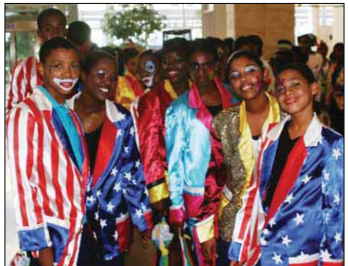
Some of the children who performed during the World Congress of International Education.