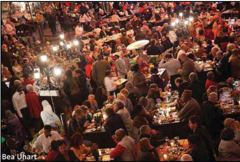
Attendees dine during North American Night at the World Congress. This event was held at an amusement park in Cape Town, South Africa.