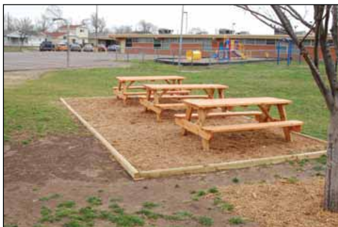
A picnic area near the playground, before and after.