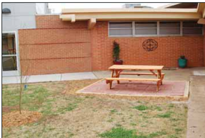
An outdoor lunch room for Hillcrest teachers, before and after.