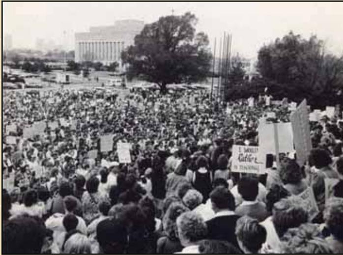
20,000 rally at the Capitol in support of HB 1017.