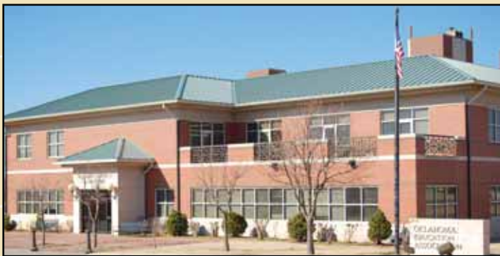
OEA Headquarters opened in 1995.

1995 – The OEA opens a new office building at its current location, 323 E. Madison, which is southwest of the Capitol. The building was paid for by a dues add-on approved by the members.