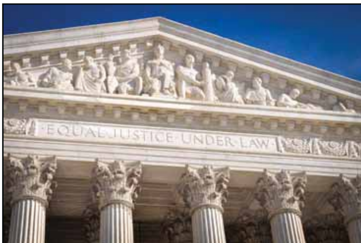
U.S. Supreme Court