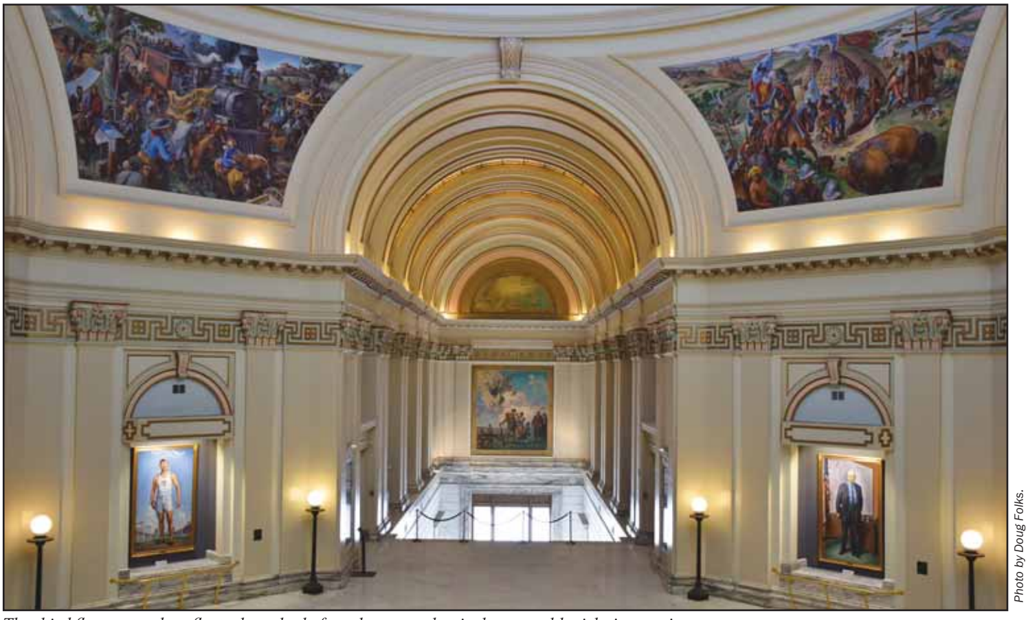
The third floor rotunda reflects the calm before the storm that is the annual legislative session. Beginning February 1, the State Capitol will be a hive of frantic activity until the end of May.