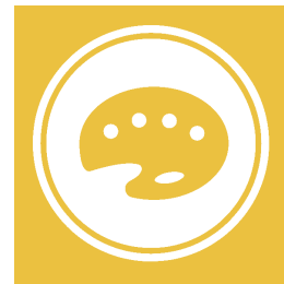
Calming art or pictures.

How can schools pay for lactation spaces? Consider bond, building, or general funds. Also consider reaching out to your PTA, community partners, or your local OEA affiliate for sponsorship of items.