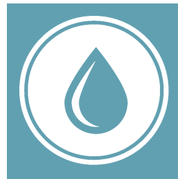
Sink or place for washing.